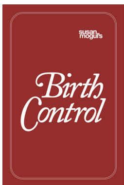
Susan Mogul's Birth Control, 2022 4 Digital Prints, 24" x 36"