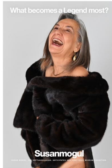
"What becomes a Legend most?" - 2022, archival digital print, 60"x40"