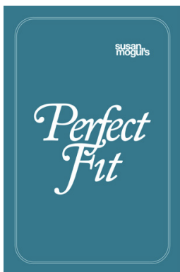
Susan Mogul's Perfect Fit, 2022 6 Digital Prints, 24" x 36"