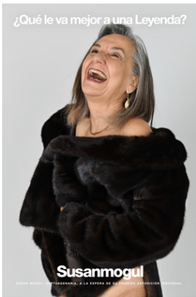
What becomes a Legend most? (Spanish) 2022 Archival Digital Print 60" x 40"