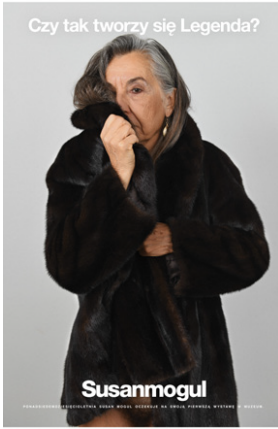
What becomes a Legend most? (Polish) 2022 Archival Digital Print 60" x 40"