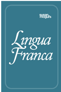
Susan Mogul's Lingua Franca, 2022 6 Digital Prints, 24" x 36"

Tales from the Mogul Archive, 2022, an Installation of 36 digital prints.