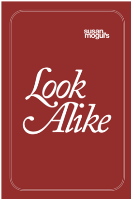
Susan Mogul's Look Alike , 2022 6 Digital Prints, 24" x 36"