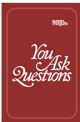
Susan Mogul's You Ask Questions, 2022 4 Digital Prints, 24" x 36"